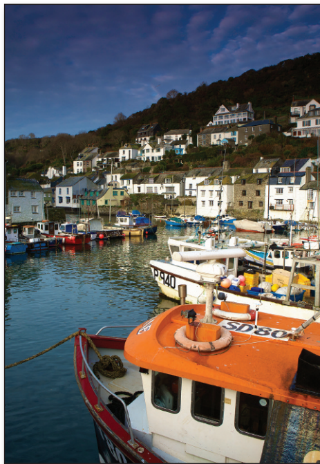
The quaint fishing village of Polperro. A popular destination in peak summertime.