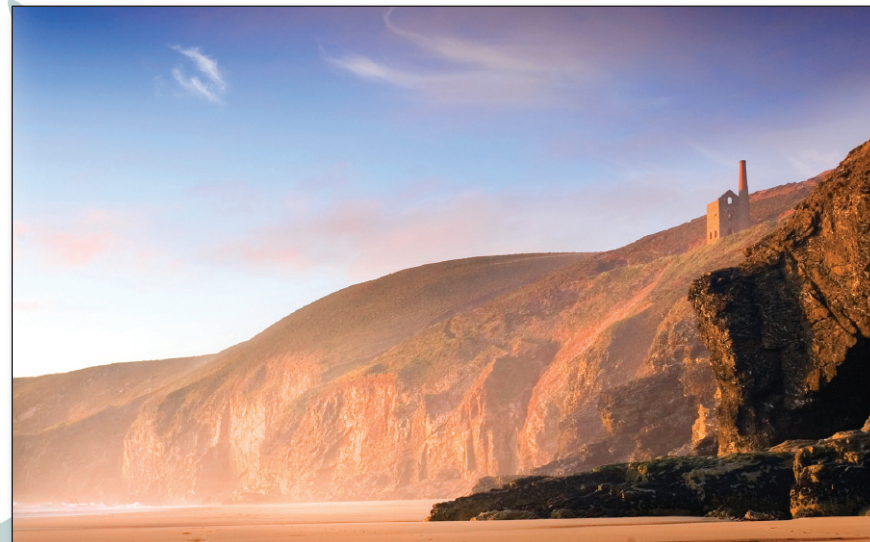
Wheal Coates tin mine.