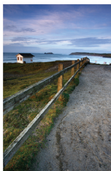
A deserted footpath leads along the cliffs.