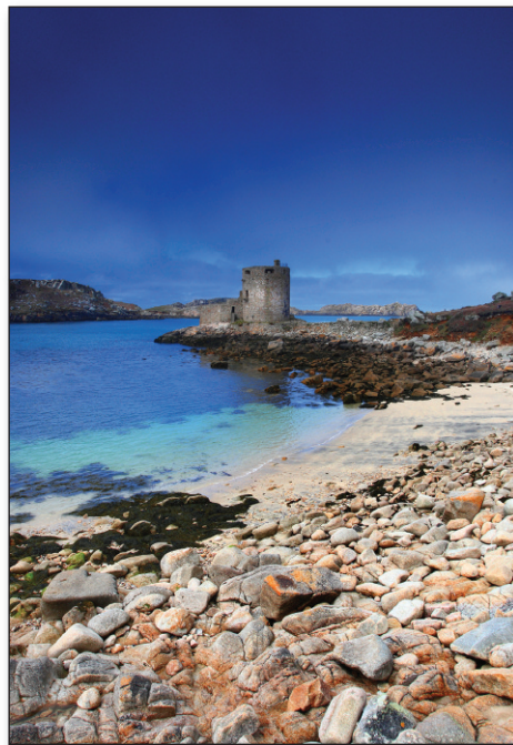
Cromwell's Castle Isles of Scilly.